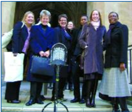
Outside the House

As guests of Durkan, WAMT's representatives stuffed themselves on a three course dinner, served up in the Cholmondeley Room, with beautiful views of the river. We polished off the meal with House of Lords chocolates, then worked off all the calories with some energetic shopping in the gift shop!