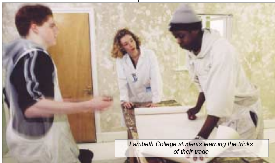
Lambeth College students learning the tricks of their trade